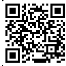
Gilroy Economic Development Video

The Council seeks to make Gilroy a destination, recently approving a term sheet with the San Jose Sharks Sports & Entertainment in paving the way for a new 100,000 square-foot facility at the Gilroy Sports Park. The project will house two National Hockey League-sized ice rinks in addition to training rooms, offices, a restaurant, and pro shop. The downtown is another priority area with significant efforts to expand its vibrant Gourmet Alley area and an adjacent project area, Railroad Alley. These efforts will supplement vibrant and growing economic assets including the city owned Gilroy Gardens, regional wineries, and the widely renown Gilroy Premium Outlets.